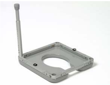
SEAT FRAME WITH ONE LEG INSTALLED